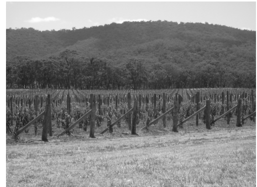
At the foothills of the Pyrenees Ranges

An upgraded irrigation system is helping keep the vineyard healthy but the drought of the last few years has everyone with one eye on the weather. The good news is that we have had some rain and with a little more, we are looking forward to a successful vintage. We expect to be harvesting in late March through to mid April.